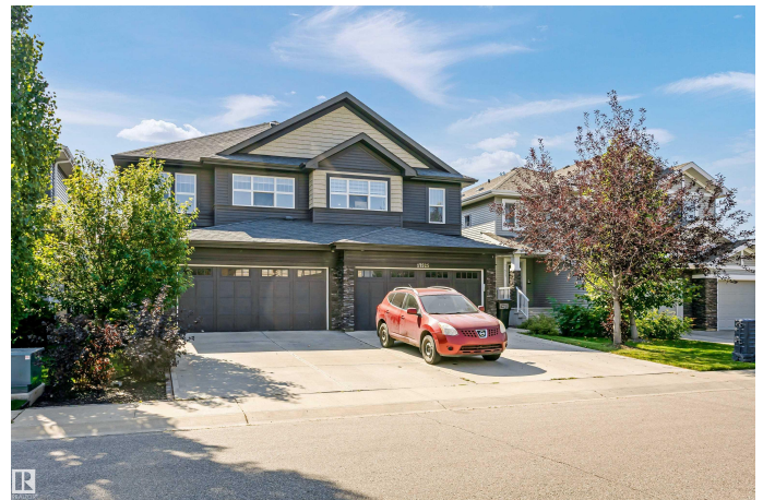
17523 12 Ave SW, Edmonton, AB

Main Floor Exterior Area 72.31 m 2 Interior Area 66.76 m 2 Excluded Area 42.84 m 2